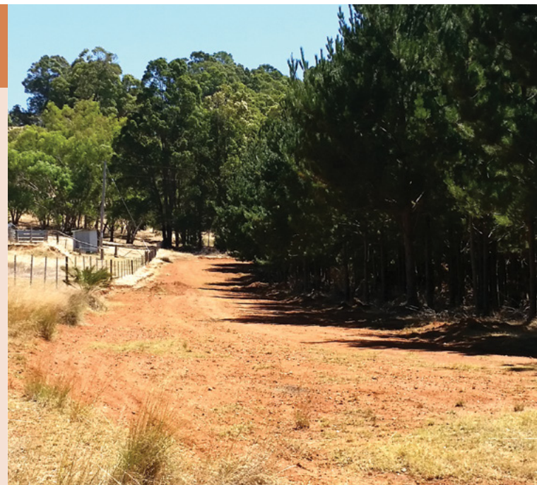
A good example of an external fire break that has a 15 m boundary